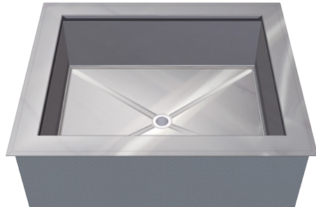
Cooling pan KW-KT for mounting in a worktop recess.